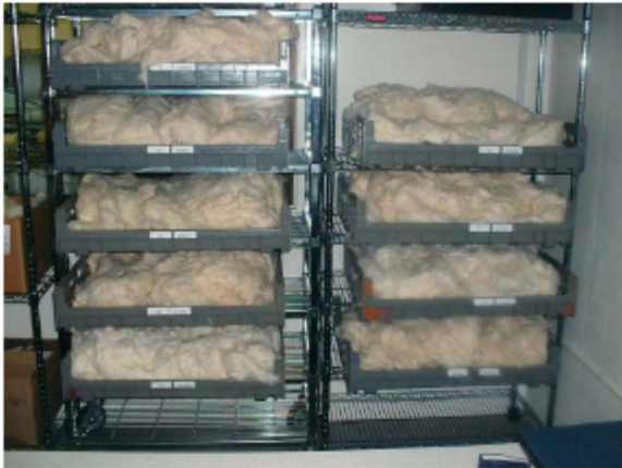
Figures: Storage of samples for conditioning [Uster]

(Recommendations) It is important to undertake regular checks of the moisture content of the cotton samples. For Upland cottons, the moisture content should not exceed the range of 6.75 to 8.25% (dry basis) and should not vary by more than 1 percentage point from that of the Calibration Cottons. Out of range samples should be allowed additional conditioning time. If the range is still not achieved, then the sample should be marked as exceptional.